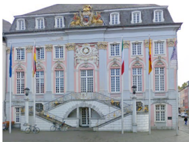
View of the Old Town Hall entrance.